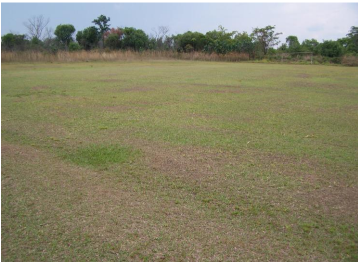
This is a picture of one half of the football pitch on which we play our matches.