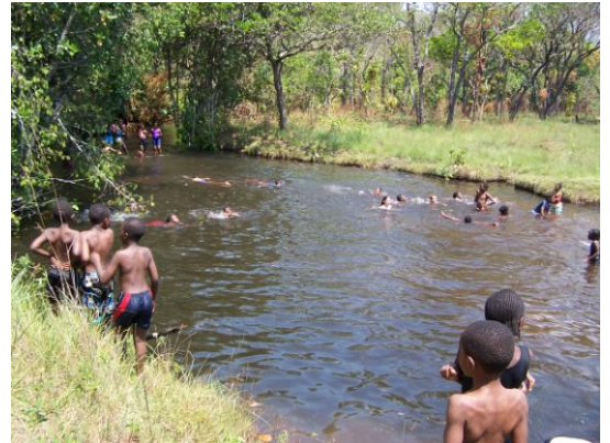
Chilling after a long ride to the cottage

After a long trip there we all got to take a dip in the river. People splashed around and had a lot of fun.