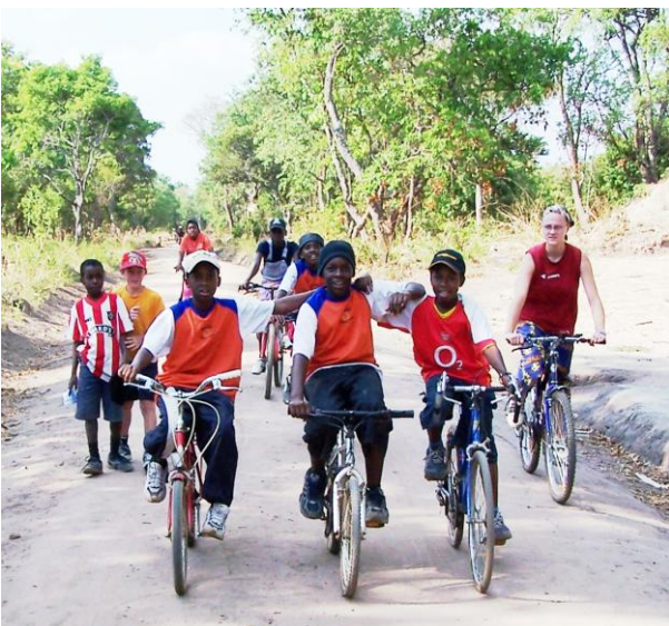
Boys show off their stunts

The bike ride to the cottage was really cool. It was a real success. Riding there was a big job for a lot of people; only a few didn't find it so hard. The boys rode the hardest of all. They went ahead and stopped at a well.