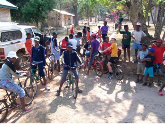
The beginning of the bike ride

The bike ride to the cottage was really cool. It was a real success. Riding there was a big job for a lot of people; only a few didn't find it so hard. The boys rode the hardest of all. They went ahead and stopped at a well.