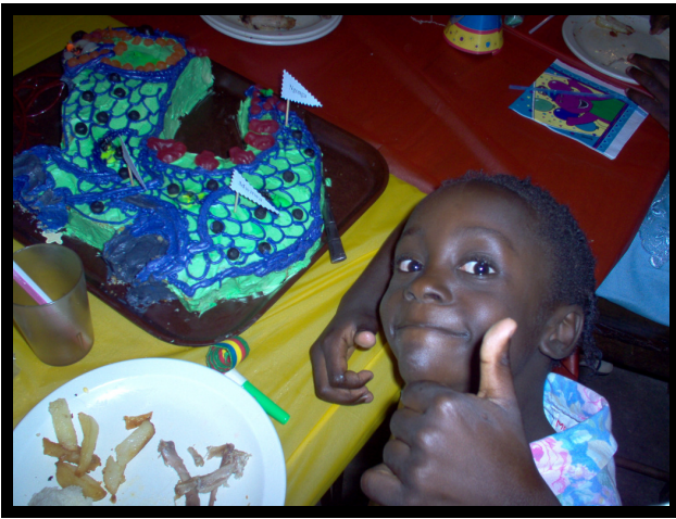
Above: A big birthday smile Below Right and Left: Some smiles from the girls dorm