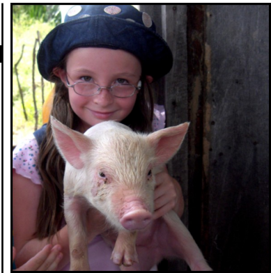
Holding a piggy at Hillwood Farm