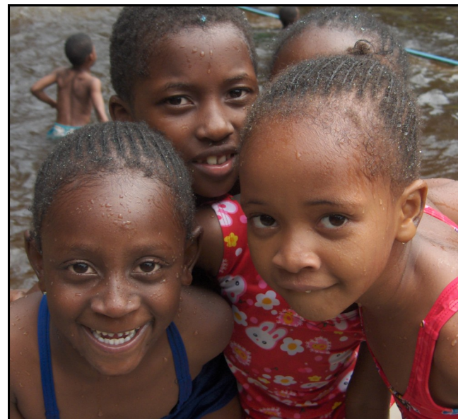
Above: Some smiley swimmers at the pool!